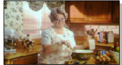
"Remember, you're not home when you're at the movies."