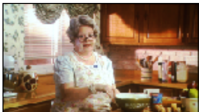
"And what do you do with your trash? Put it In the trash container!"