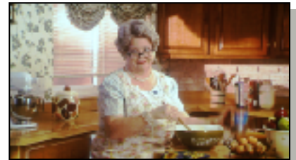
"You're going to turn your pager off right? and your cell phone. So much noise today."