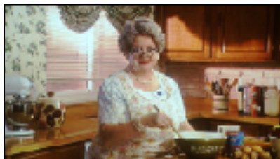
"So keep your feet on the floor."