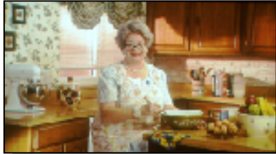
"Your Going to The Movies."

Here's a new and different trailer designed to inform moviegoers of your theatre's policies. Starring "Good 'Ole Mom", who is still trying to teach your audiences to use good manners. This 1:10 trailer will humorously grab and hold everyone's attention for successful and measurable results.