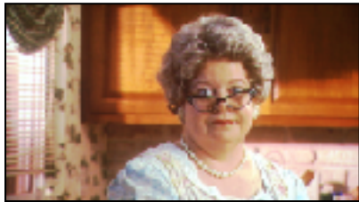
"You can't talk in the theatre. Not even a whisper". . .