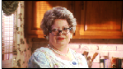
"I'm Glad. Movies are good."