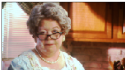
"Those nice, comfy seats in the theatre - those are other people's furniture."