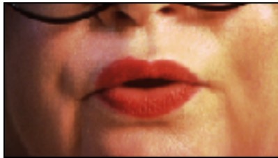
" Whispering is talking. It bothers people."