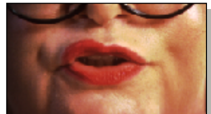
"You'll be eating. Of course you'll be eating. Soda, popcorn, candy, umm yummy."